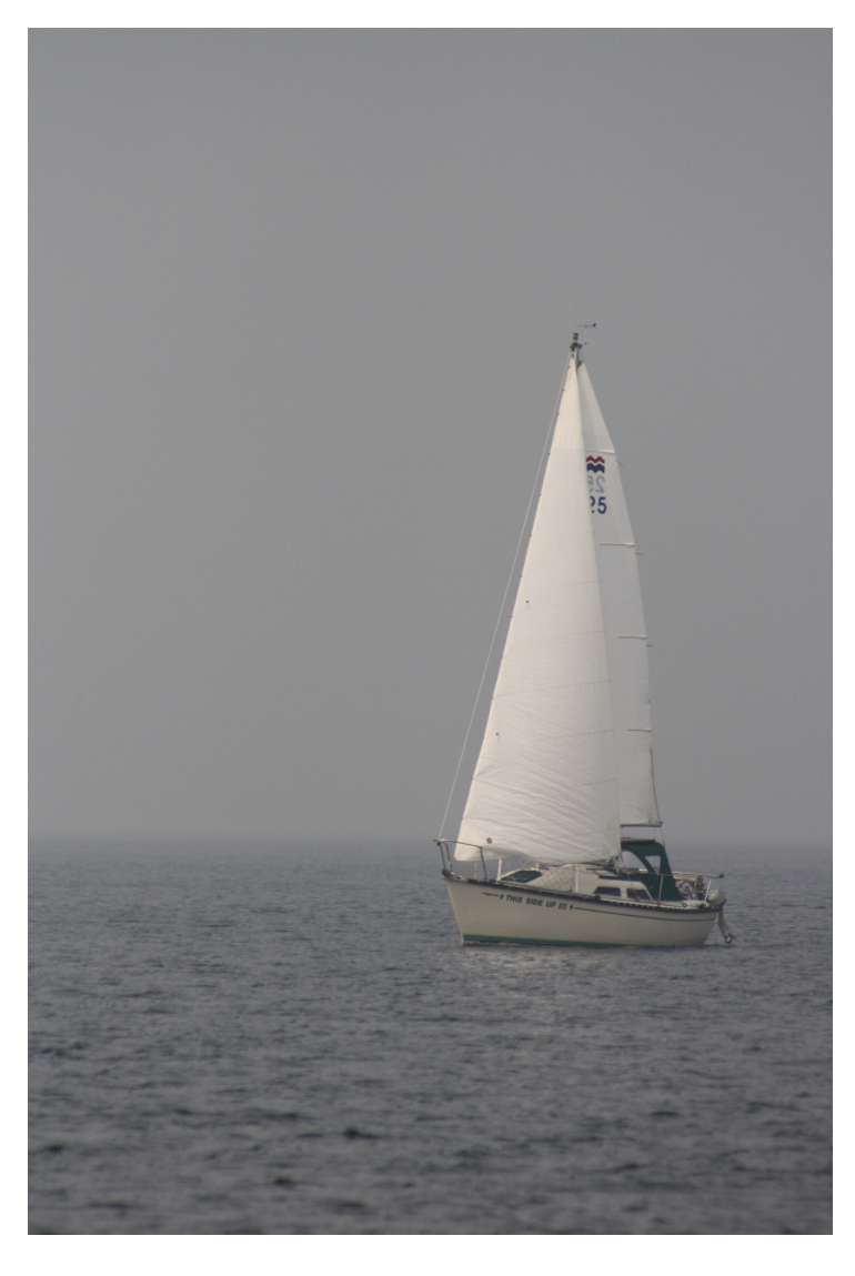
Hazy Sail - DB